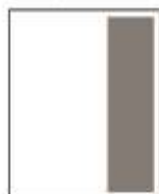
1/3 Page (vertical)