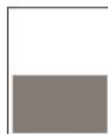
1/2 Page (horizontal)