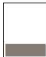
1/4 Page (horizontal)