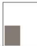
1/4 Page (corner)