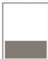
1/3 Page (horizontal)