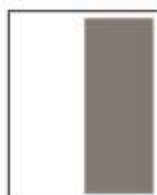
1/2 Page (vertical)