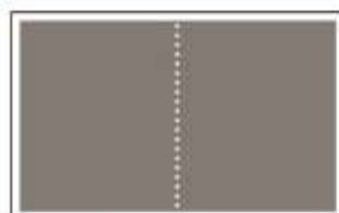
Double Page Spread